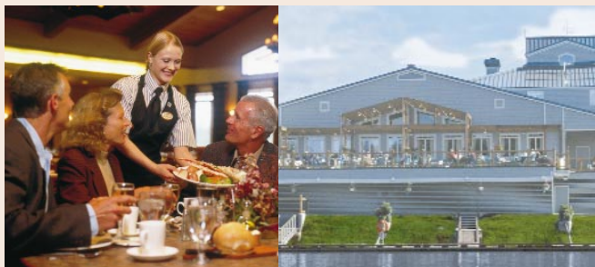
LEFT The Fairbanks Princess Riverside Lodge offers first-class amenities including fine dining.