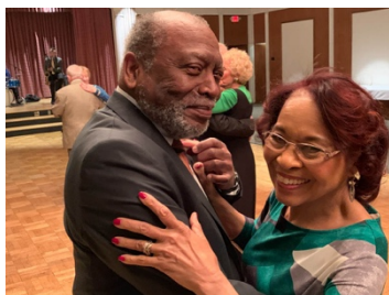
No green hair?