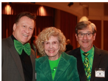
All in green!