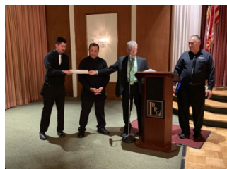
Thank You for years of Service!