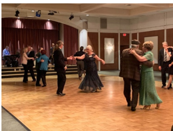
Kicking up our heels