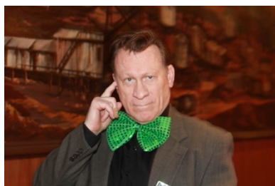
Wonder if they will notice my tie?