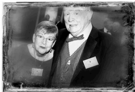
Even scary pictures

Our clubs 70 th birthday is next month so if you can, please provide us images of yourselves. Vicky Kuhn is preparing some materials for "the birthday party" and she needs your help.