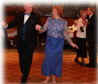
The dance music was great this evening! The Grays make it look easy!