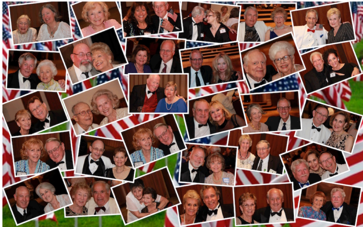
The Topper's tribute to Memorial Day

We are now 70 years old! The club began in 1946 just after World War II and returning men and women were looking for places to dance!