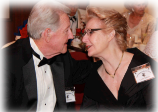
Romance is in the air