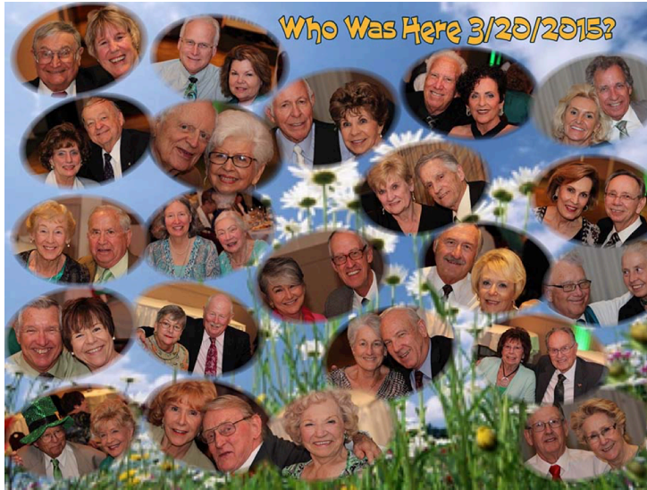
Everyone was Irish at our last dance!

Spring is when you feel like whistling even with a shoe full of slush. ~Doug Larson