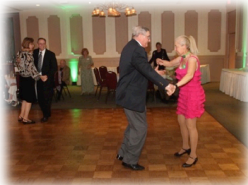
Dancing is underway