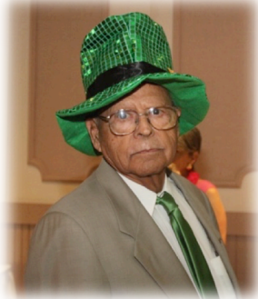
He could have danced all night! Everyone loved his bonnet