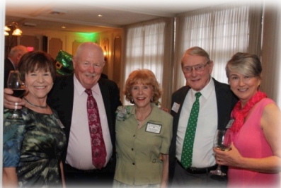
The Toppers friendships are special!