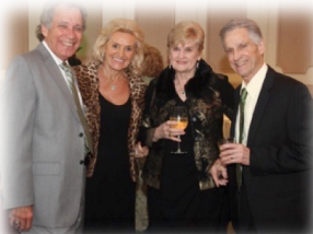
Welcome to the dance