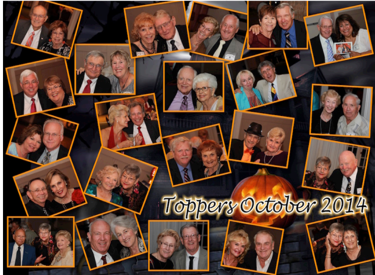
We all made it through the spooky dance...!

It's Invite A Calorie To Dinner Season... Must Dance!