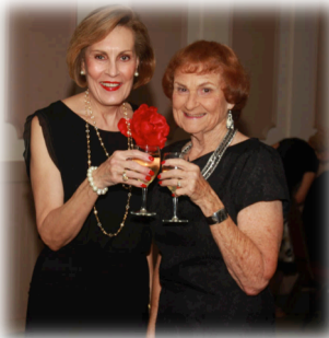
Meeting and greeting