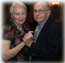
Smiles and smiles