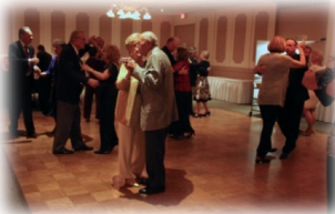
Catching up with friends