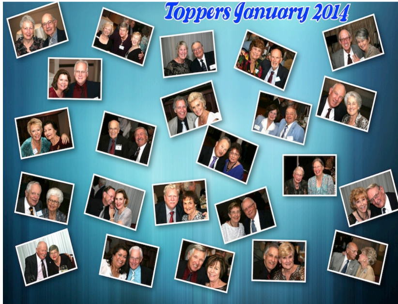
The January dance was excellent