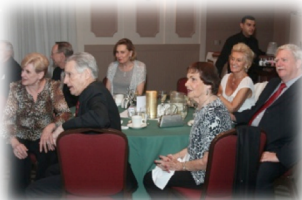
Singing Happy Birthday