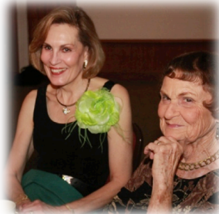
Miles of smiles