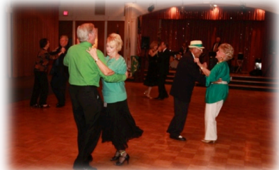
OK guys! Let's dance

Meteorologists generally define four seasons in many climatic areas: spring, summer, autumn (or fall) and winter. These are demarcated by the values of their average temperatures on a monthly basis, with each season lasting three months.