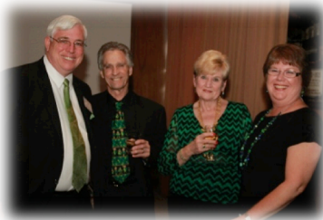
A Sea Of Green