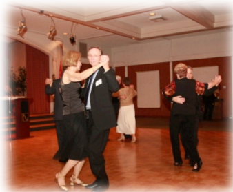
Dancing is fun and keeps us warm