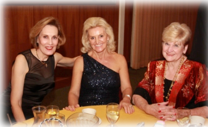
Watching the dancers