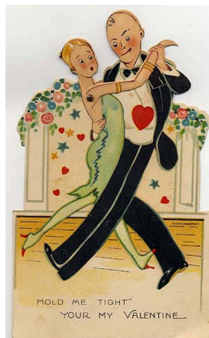
Valentines Day and Dancing – A Perfect Match!

This poem was written to honor the first anniversary of the engagement of King Richard II of England to Anne of Bohemia. A treaty providing for a marriage was signed on May 2, 1381. (When they were married eight months later, they were each only 15 years old).