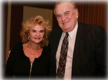
Miles of smiles