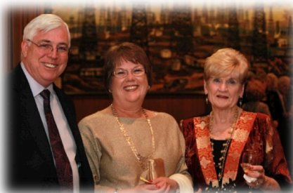
Tripping the light fantastic