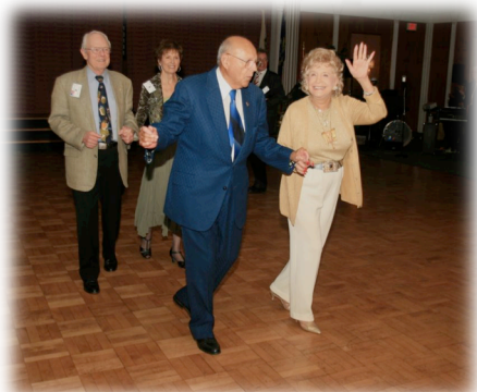
Mixing it up