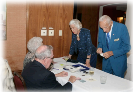
Checking in was easy