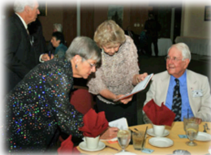
Doubling checking the lists