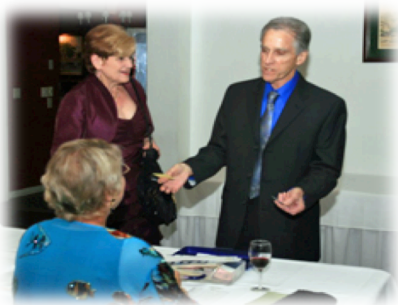
My invitation was eaten by the dog