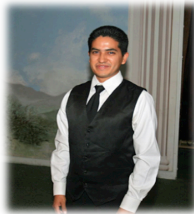
Guess who is getting married???