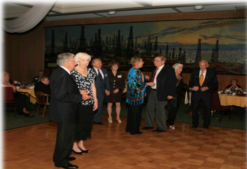
Ready for the Anniversary Waltz.... It's tradition

How beautifully leaves grow old. How full of light and color are their last days. ~John Burroughs