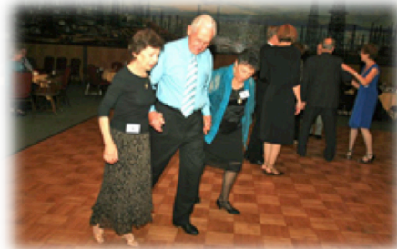
Polka time at Topper's