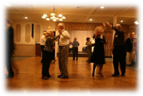
Dancing the night away