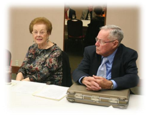
Serious work at the Board Meeting