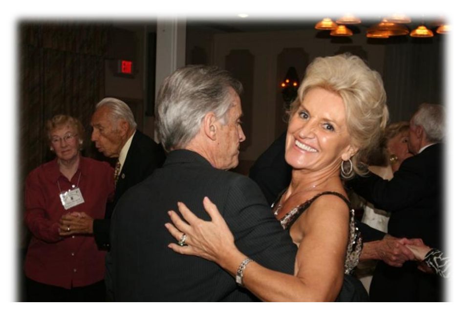
Mixing it up during the mixer!

You can dance anywhere, even if only in your heart. ~Author Unknown