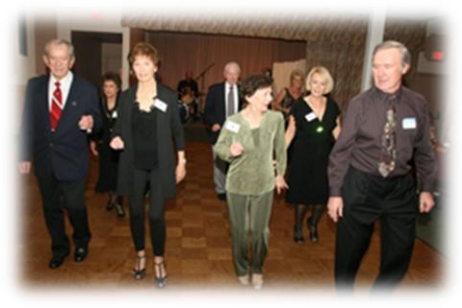
Beware, line dancers at work!