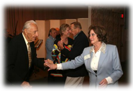
The mixer is always fun!