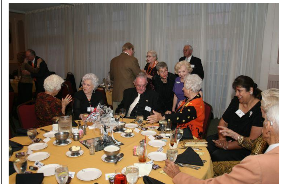
October 2010 Visiting Gets Underway Immediately

Eat, drink and be scary. ~Author Unknown