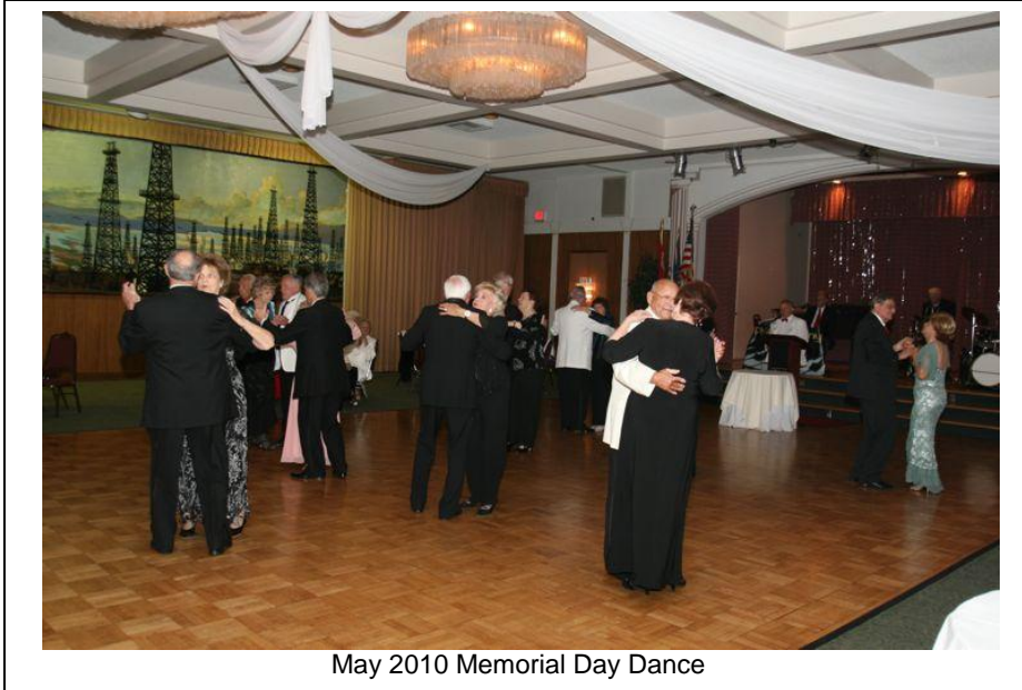
May 2010 Memorial Day Dance

Welcome back to a new season of Dancing With The Toppers!