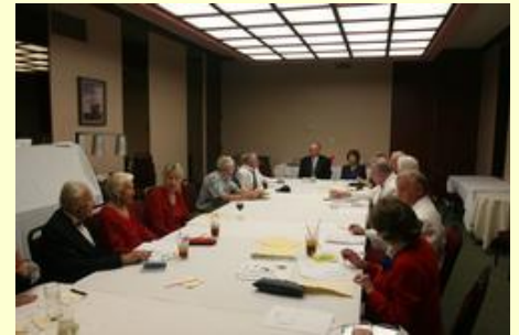
The Board Hard At Work