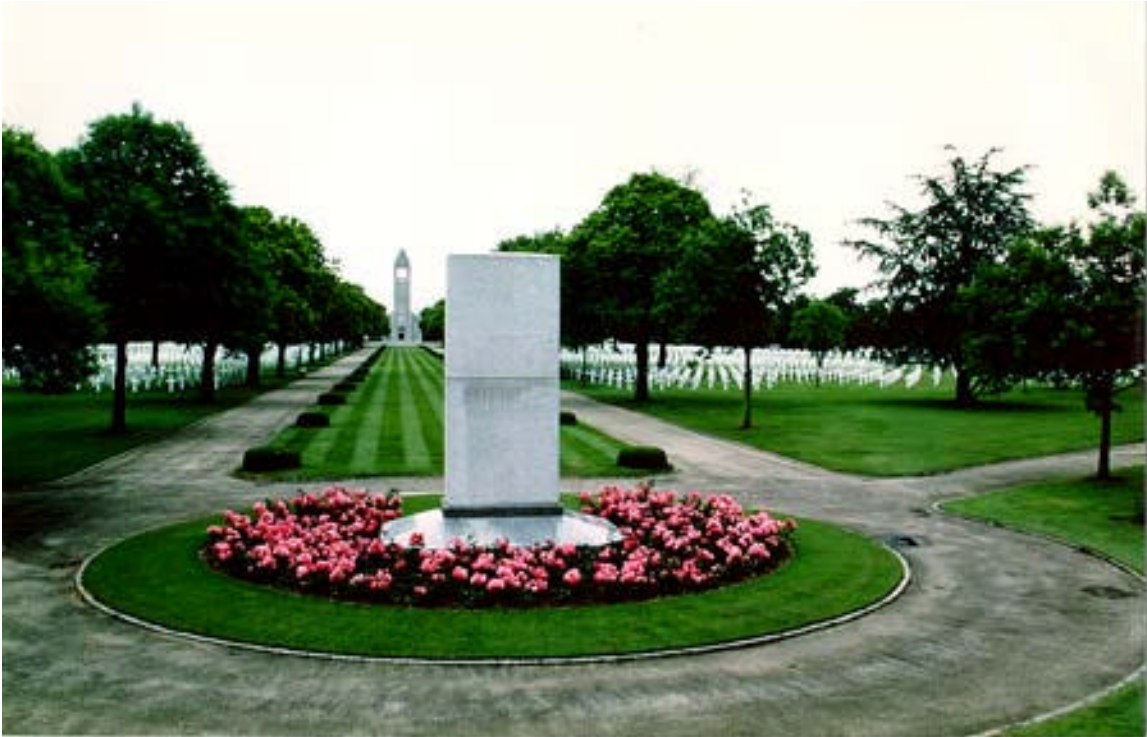
View of Cemetery from Cenotaph

six U.S., British and Canadian divisions began landing on Utah, Omaha, Gold, Junno and Sword beaches in the greatest amphibious assault of recorded history.