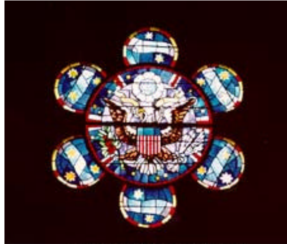
Main Chapel Window

through the ring of defenses that the enemy had established around the beaches. The stage was set for the breakout with a paralyzing air bombardment on 25 July by the U.S. Eighth and Ninth Air Forces and the Royal Air Force along a five mile front west of St. Lo. Aided by British forces pinning down the enemy in the eastern portion of the beach area toward Caen, the U.S. First Army stormed out of the beachhead liberating Coutances three days later. Within a week, the newly activated U.S. Third Army had cleared Avranches and was advancing toward Paris on a broad front with the First Army. The two armies fanned out westward toward Brest, southward toward the Loire, and eastward toward the Seine. On 7 August 1944, one week after the opening of the Avranches gap, a powerful counterattack was launched by the enemy, in an attempt to cut the columns of the advancing U.S. First and Third Armies. After initial success in the region of Mortain, the U.S. First Army was able to stem the counterattack and push back enemy forces.