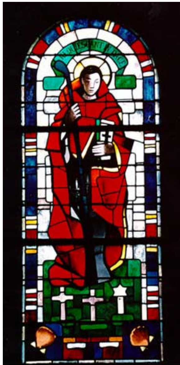
Stained Glass Window

Immediately above the entrance door in the museum room are the