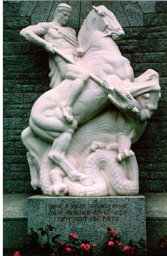
Youth Triumphant over Evil