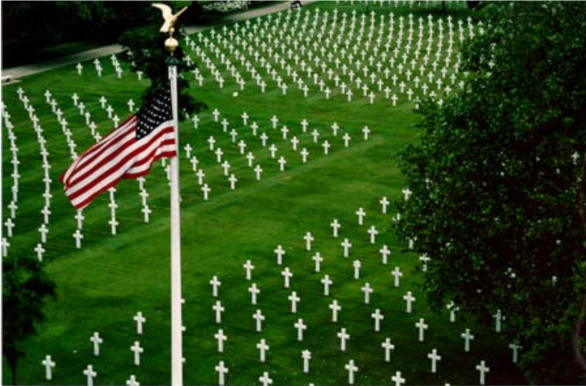
Burial Area from top of Chapel

gate with its piers of gray granite. The driveway contains space for limited visitor parking and there is a small parking area across the highway.