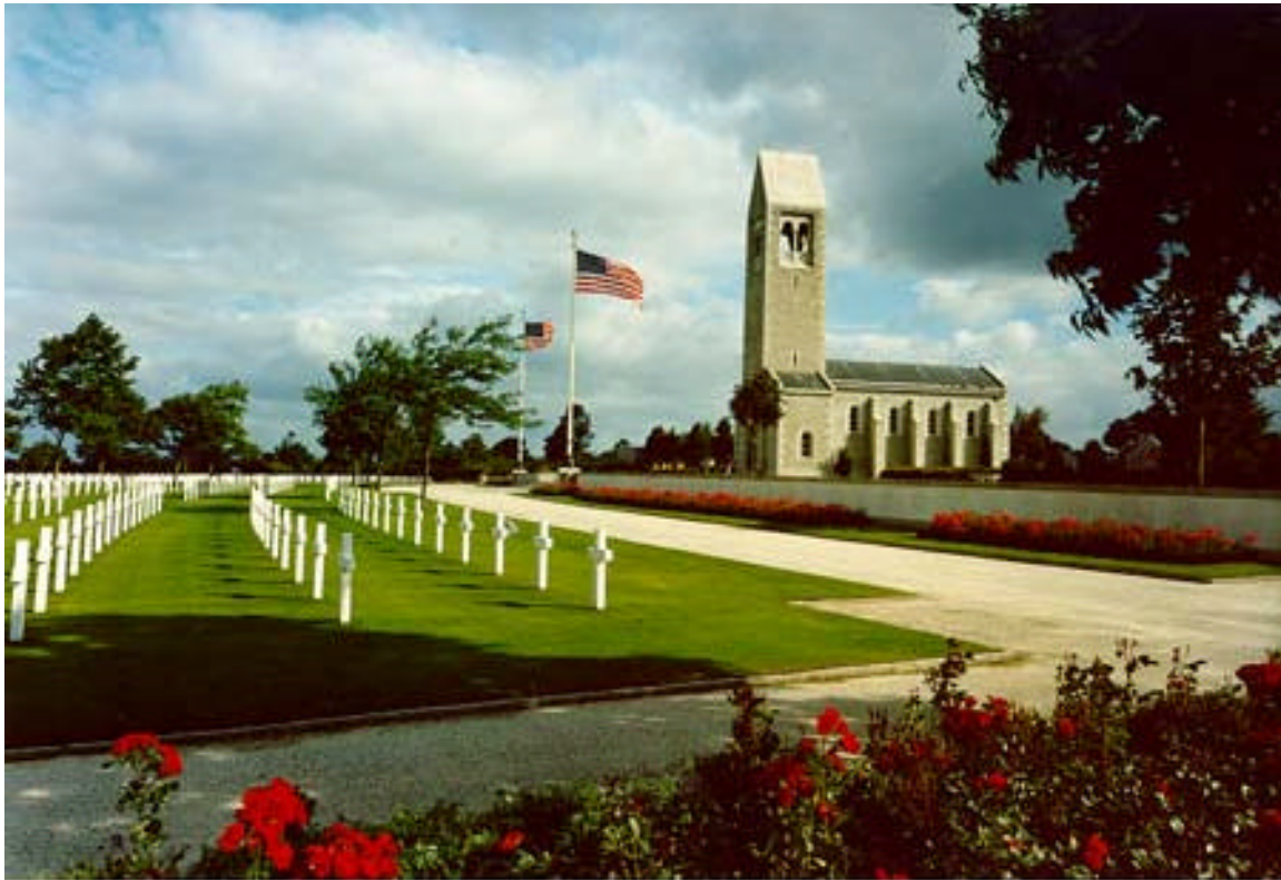
Tablets of the Missing on Wall in front of Chapel

On the wall below the window and above the altar is a blue and gold damask hanging. Centered on the altar is a Latin cross flanked by two candlesticks.